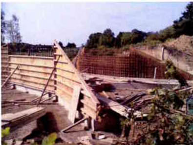
Bridge No.3 under construction

Bridges No's 3, 4 and 5 - A casual glance at all the remaining structures indicated that they were incapable of economic repair with both inwardly leaning fractured abutments and rust ridden beams. These would be totally unacceptable by modern railway standards even if they were capable of restoration and are therefore being rebuilt. So there are exciting times ahead. The bridges will be constructed over a three month period, hopefully taking advantage of the dry summer weather. The bridges have been generously donated and will be shot blasted, repaired and painted in the Rother Valley Railway yard prior to installation.